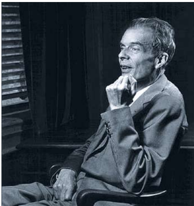
The British Empire and its propagandists aim to subjugate entire populations to a form of mental slavery—what the evil Aldous Huxley openly praised as a “concentration camp of the mind.”