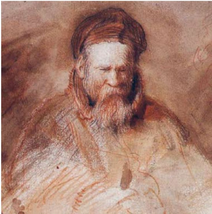
The attack on Aristotelean dogma by St. Peter's friend, Philo Judeas of Alexandria (above), was in implicit opposition to what became that medieval culture of ancient Rome and of Byzantium whose degeneration culminated in the outbreak of the 14th-Century "New Dark Age."

nance on the world represented, since 1971-72, by the Inter-Alpha Group in global finance. Those considering the history of the Catholic Church's troubles, should recognize the Inter-Alpha Group, which is at the center of British imperial financial interest today, as an echo of the same Venetian tradition which orchestrated the Italian merchant bankers, and European nations' destruction by the means of a dirty trick played by a Venetian monetarist cabal. There are, unfortunately, many nations who have proven sufficiently gullible to tricked in a similar way today.