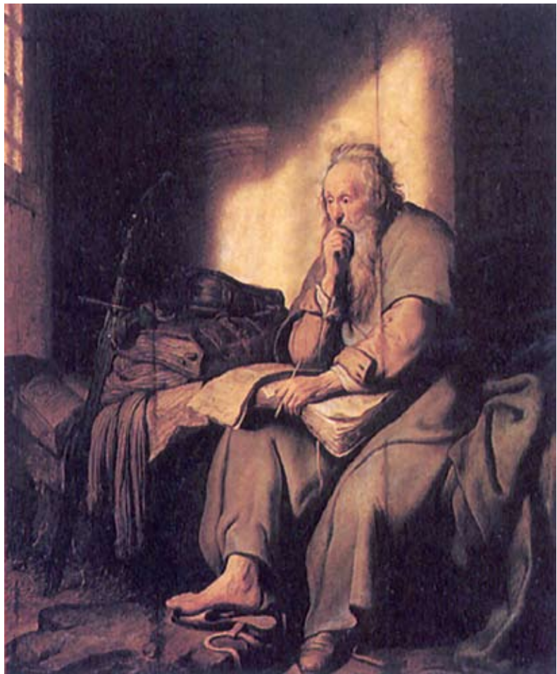
St. Paul, in his first letter to the Corinthians, writes, "I say therefore to the unmarried and widows, It is good for them if they abide even as I. But if they cannot contain, let them marry: for it is better to marry than to burn" I Corinthians 8-9. Shown: "The Apostle Paul in Prison," Rembrandt (1631).

Although it has been widely alleged, that the problem is one specific to the internal affairs of the Catholic Church; that allegation is not merely exaggerated, but misleading. Without denying the very ugly truth about