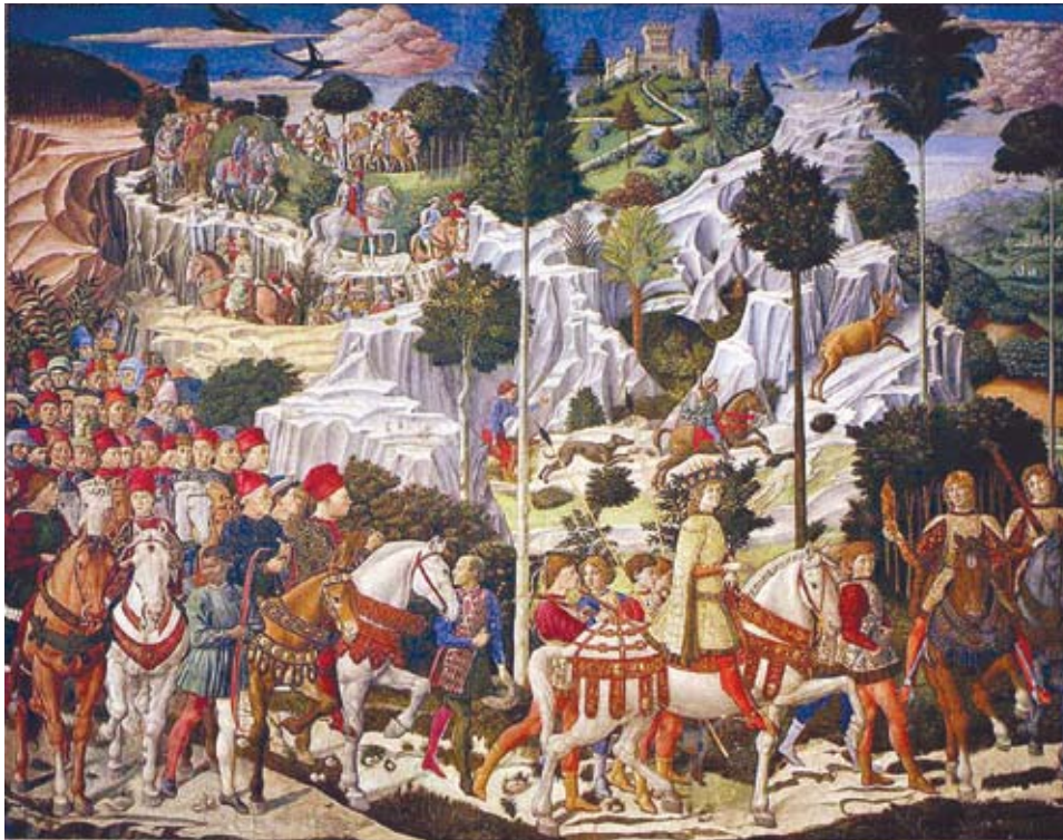
As distinct from the Aristotelians, Sarpi adapted to the realities of modern European maritime culture's development, during the period from the great ecumenical Council of Florence (1439), through the late 16th and early 17th centuries. Shown: Benozzo Gozzoli, "The Journey of the Magi" (1459-61), portrays the arrival in Florence of the many foreign participants, for the Great Council whose purpose was to unite the Eastern (Byzantine) and Western (Roman) churches.

Antonio Schinella Conti, 8 were deployed to lay the foundations for what became the amplified Sarpian dogma, the perverted doctrines of science and culture, doctrines which have led into the pure evil represented by the modern imperialist positivism of not only Karl Weierstrass, Felix Klein, and David Hilbert, but, also, the more extreme form of moral degeneracy of H.G. Wells and Bertrand Russell.