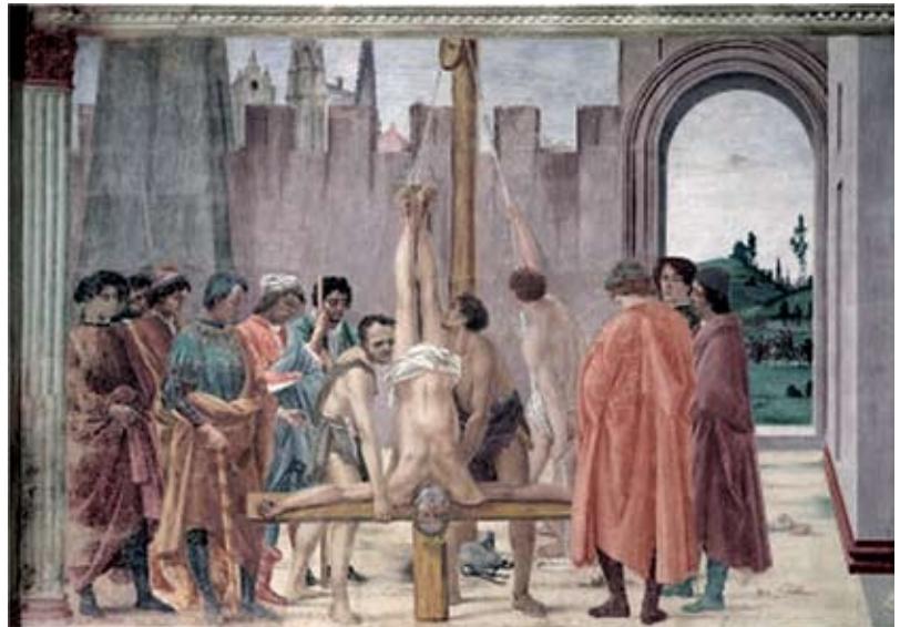
Since the time of the crucifixion of Jesus and the subsequent Roman imperial crucifixions of the Apostles Peter and Paul, the systemic character of the conflict of the heirs of the Roman Empire, like that of the devotees of the British Empire of today, is antipathetical to the Mosaic principle expressed in Genesis 1. Shown: "The Crucifixion of Peter" (fresco, Brancacci Chapel, Florence), Filippino Lippi (1485).

The currently proper starting-point for considering the actually immediate issue, that of the current programs of genocide formally adopted as law by the British Blair and U.S. Obama governments, is to take steps to sanitize the discussion by concentrating on the very large and ancient historical fact, that this referenced scandal dates, in matter of fact, from a time long before the Roman imperial order for the crucifixion of Jesus of Nazareth, which was launched by an imperial Roman order which was uttered and executed under the spe-