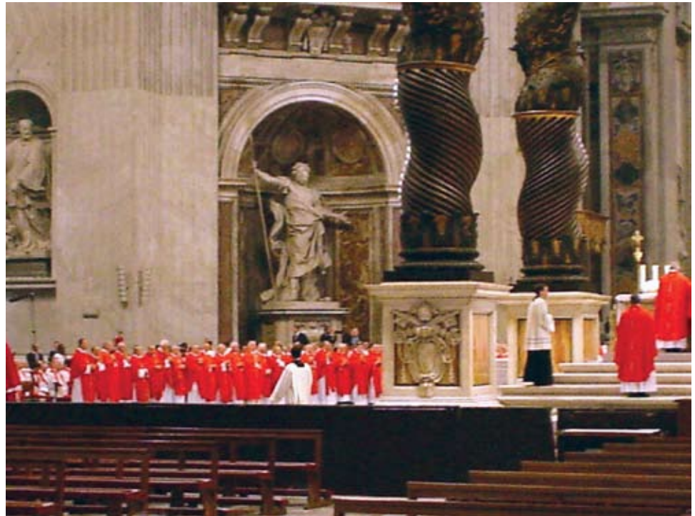
“The principal fact from which our attention must not be distracted, is, that, among all other matters which might be taken into account, the Catholic Church has continued, in fact, to be the principal rallying point, globally, against the current, largely criminal, British doctrine of global genocide....” Shown: Cardinals at St. Peter’s in Rome.

Such are the current crimes by the British Royal House and its current, puppet, U.S. President Obama, which have now been actually launched, under a Nazi-like law, as a carbon copy of Adolf Hitler’s war-time genocide, a carbon copy of Hitler’s policy which is now