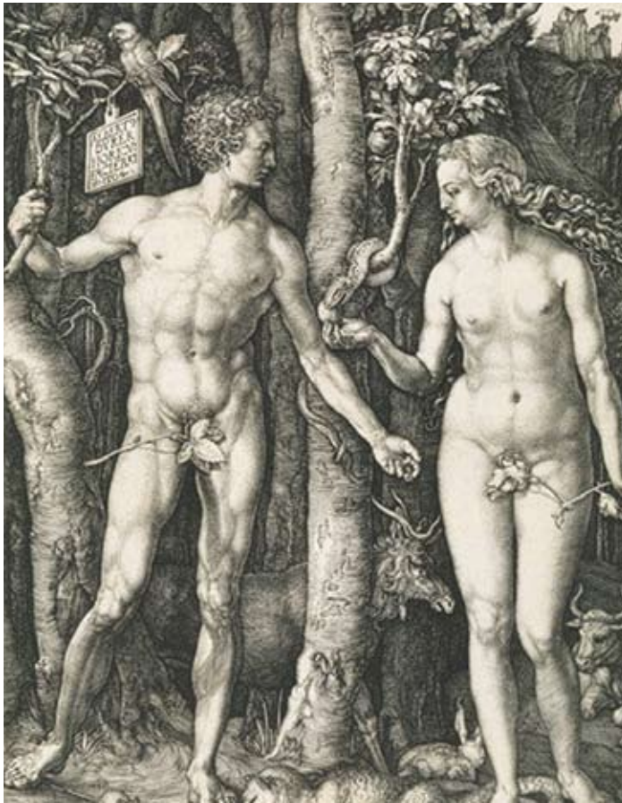
“The intention of human existence, as distinct from other living species, is the continuity of progress of man’s development and work on behalf of works which partake of a notion akin to ‘the greater glory of God.’” Shown: “Adam and Eve” (engraving by Albrecht Dürer, 1504), the metaphorical parents of all mankind.

human species, which is the work of qualitative progress of mankind’s condition and progress, and, thus, the advancement of the specifically unique creative-mental powers of the human individual’s ability to serve a yearning intention consistent with mankind’s leap from the bounds of our Earth, to colonize within our Solar System, and, beyond.