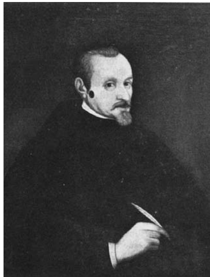
The opposition to the evil Paolo Sarpi's (above) philosophical Liberalism, was represented by the Italian patriot, and Leonardo da Vinci collaborator, Niccolò Machiavelli (right), the founder of modern European military-strategic doctrine and statecraft.

From the viewpoint of modern physical science, rather than the Laputan traditions of modern positivism, empiricism is thus properly identified as the special, pro-Satanic dogma of the founder of modern Liberalism, Paolo Sarpi, a dogma which was never intended to serve as an expression of science, but has been an