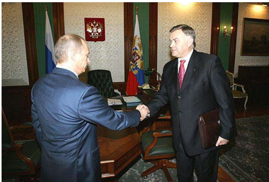
Presidential Press and Information Office

LaRouche: Well, no, they wish—it's political. They're frightened. They think that they're hostages of the present government. Therefore, they say whatever they think is expected of them, if they're going to be