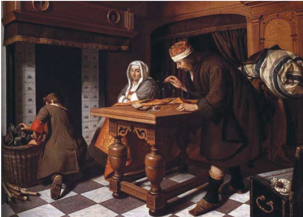
What is systemically wrong with the world economy? The belief in money as a standard of value has led, as it did in the 14th Century, to the current global breakdown crisis. Shown: "The Gold Weigher" by Cornelius De Man (Dutch, 1670-75).