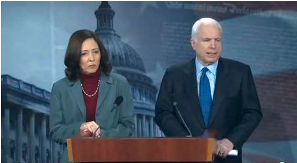
The Glass-Steagall Amendment, introduced on May 6 by a group of Senators led by John McCain (R-Ariz.) and Maria Cantwell (D-Wash.), is the act of a growing group of patriotic Members of Congress, LaRouche asserted. The two Senators are shown here at a press conference in December 2009.

will crash the British system. When we have crashed the British system, by re-establishing Glass-Steagall, by doing that, we're going to create a situation where the British will no longer be able to impose these things."