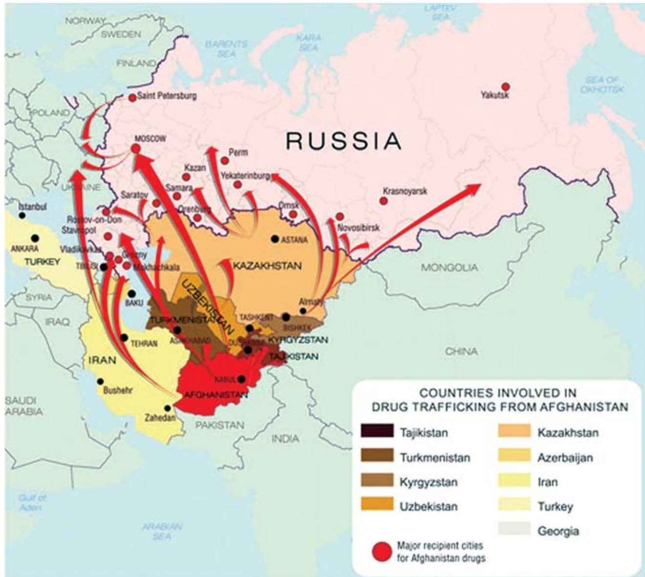
FIGURE 1 Main Routes of Heroin Trafficking from Afghanistan to Russia

Institute for Demography, Migration and Regional Development