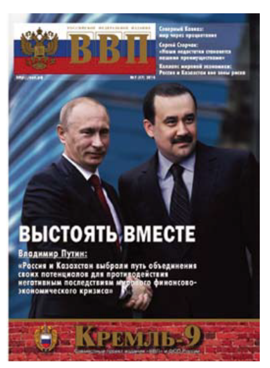
VVP's current issue features Russian Prime Minister Vladimir V. Putin (left) on its cover, with his counterpart from Kazakstan, Karim Masimov.

The growth of the short-term portion of the U.S. national debt, compared with budget revenue, resembles a tsunami. As of May 2008, the amount of debt falling due within the subsequent three months was equal to 410% of average monthly revenue. By May 2010, this amount was 827% of monthly revenue.<sup>4</sup> In dollar terms, it reached $1.4 trillion.