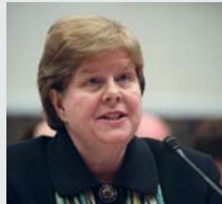
Christina Romer, Chair, Council of Economic Advisors; left Sept. 3, 2010.