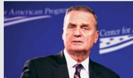
James Jones, National Security Advisor; announced his resignation Oct. 8, 2010, to take effect at the end of October.