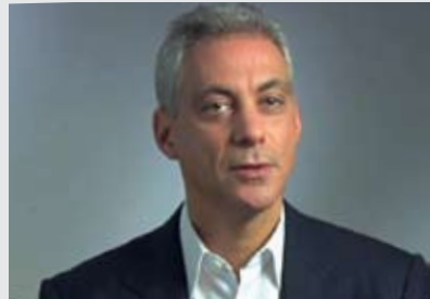
Rahm Emanuel, White House Chief of Staff; left Oct. 1, 2010.