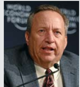
Larry Summers, head of President's Economic Council; announced his resignation on Sept. 21, 2010, to take effect in January 2011.