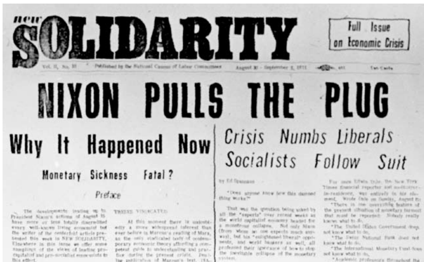
Lyndon LaRouche in 1971 realized, as no one else did, the full import of President Nixon's Aug. 15 decision to collapse the Bretton Woods system.

fixed-exchange-rate system, and replaced it with floating exchange rates, and created the Eurodollar market and the uncontrolled money creation in offshore markets, he said, at that point, that, if you continue on this road, this will lead either to a new depression and fascism, or to a new world economic order.