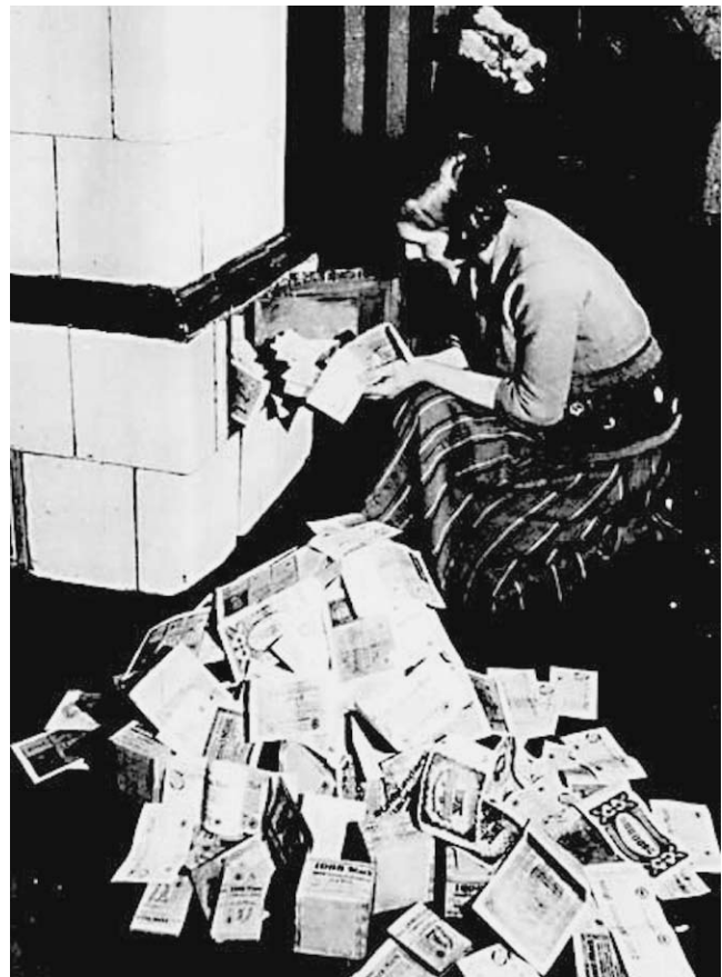
Germany's 1923 hyperinflation hit only one country, whereas today the globalized system is threatened.

You have a similar unprecedented development with the Finance Minister of Germany, Wolfgang Schäuble commenting on Ben Bernanke's decision to print money, calling it "hopeless" and "clueless," saying pumping money will not solve anything, and that he will bring it up at the G-20. Now, the reason Schäuble is saying that—and normally, this present government would be very, very pro-American and pro-Atlanticist—but in Germany, we do have the experience of 1923. Every child has many stories from their family, from the grandparents, from the parents, of what it does if you have hyperinflation, because hyperinflation is the most brutal assault on the income and the savings of the average person. In Germany, you know, people thought they had maybe 10,000 Reichsmarks for their pensions, and then, all of a sudden, when inflation exploded, in half a year, from Spring 1923 to November, all of a sudden one piece of bread cost 10,000 Reichsmarks, and all this money was out the window.