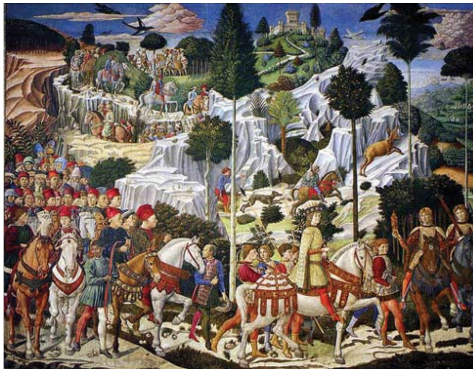
The 15th-Century "Golden Renaissance" revived European civilization following the 14th-Century "New Dark Age." Shown: "The Journey of the Magi," by Benozzo Gozzoli, 1459-61, a metaphor for the visit by leading scholars, statemen, and intellectuals, to the Council of Florence (1439).

Notably, the origin of new, valid expressions of creativity, is located in the domain corresponding to the Classical poetic method of metaphor, metaphor as a physically-experimentally anti-entropic, humanly willful discovery of what corresponds to a principle of the universe. Life itself is such a universal principle; human cognition as a principle, is a universal principle of a