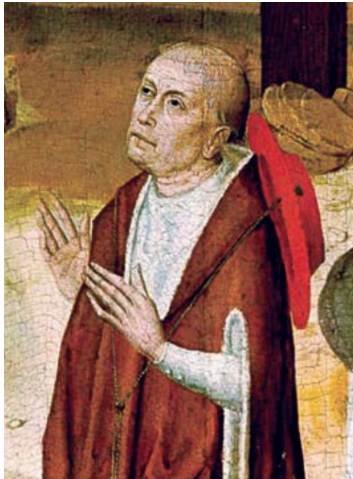
Nicholas of Cusa, the great “polymath” behind the ecumenical Council of Florence, is the founder of modern science.

That Fourteenth-century “New Dark Age,” is to be remembered, since the so-called “Norman Conquest,” as the period of the notorious Hildebrand, a period dominated by evil Crusades, such as the Norman Conquest itself, warfare launched under rising Venetian monetarist financing and manipulations. It was a period which, from the time of the Norman Conquest into the depths