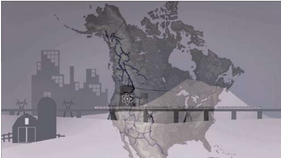
Rather than the term “infrastructure,” LaRouche has introduced the term “platform,” to describe an “upshift” of the Biosphere, produced by the application of the discovery of a universal physical principle. NAWAPA, as conceived by LaRouche and his scientific Basement team, represents such a platform. This image is taken from the LPAC-TV video, “NAWAPA, Water for Life” ( http://larouchepac.com/node/15570 ).