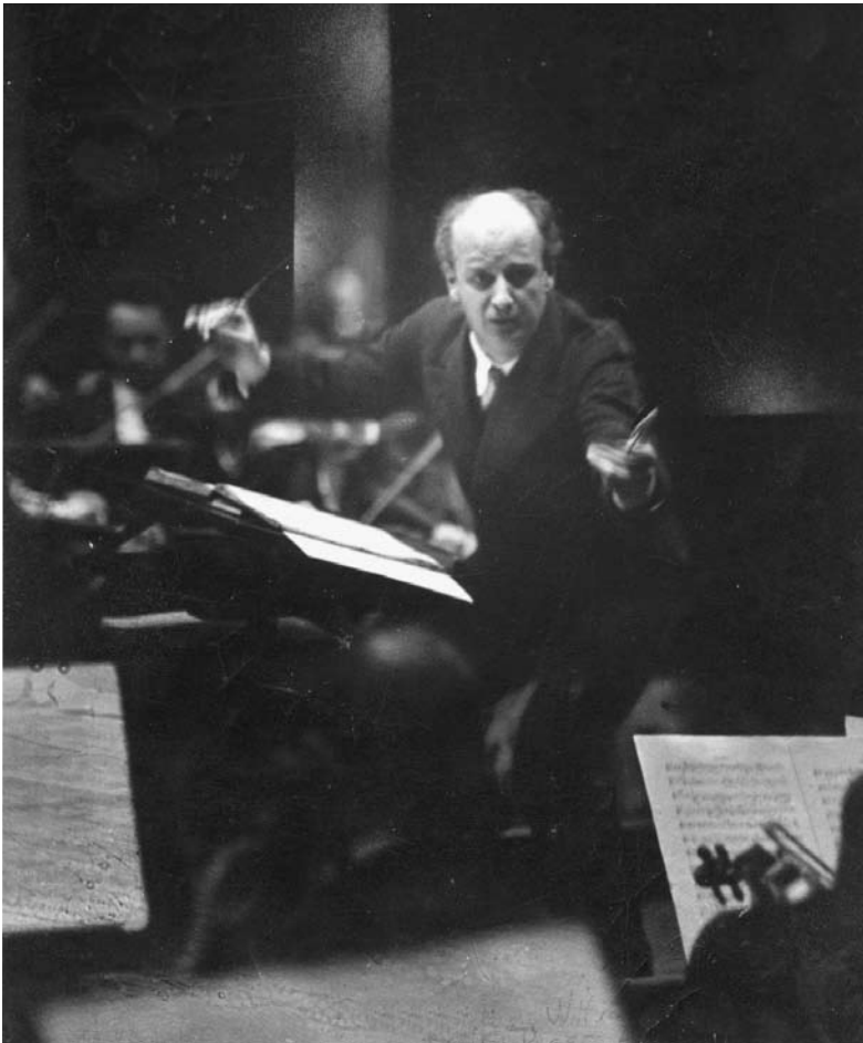
“The great obstacle to human reason has been the popular delusion of belief in ‘sense-certainty,’” LaRouche writes. As the great conductor Wilhelm Furtwängler warned, “music requires its performance ‘between the notes.’”

achievement had been, what the later Eratosthenes underscored as the method of construction required for the duplication of the cube.