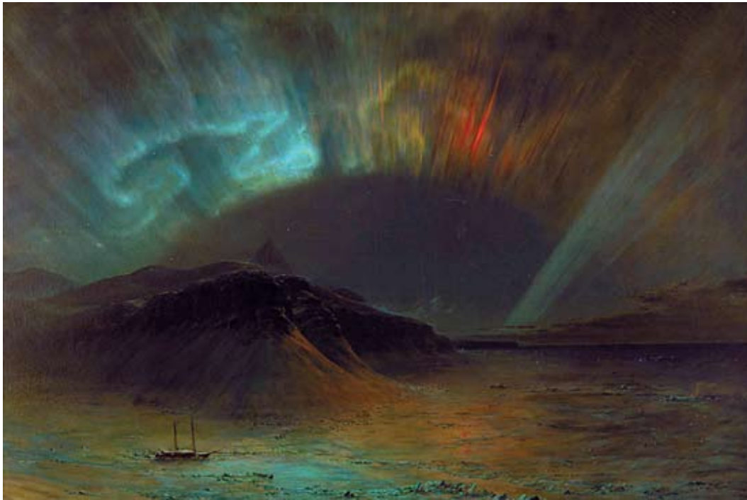
Recent investigations bearing on the role of cosmic radiation “permeating what is never, and nowhere a part of ‘empty space,’ now depend on deeper insight into the conclusive quality and forward-looking implications of the apparent qualitative divisions, and interrelations among the Lithosphere, Biosphere, and Noösphere,” within our galaxy. Shown: “Aurora Borealis,” by Frederic Edwin Church, 1865.

nomic forecaster since my first such success in 1956-7, all of my own significant contributions to any actually competent notion of a physical science of economy, have been, essentially, a product of the interrelationship between my own knowledge of a physical-economic process as such, and the foundations, in the fundamental contributions of Riemann, for appreciating what I later came to recognize as the indispensable function, for a competent science of economy, of Vernadsky’s rigorous treatment of the respective and interdependent notions of the lithosphere , biosphere , and noösphere .