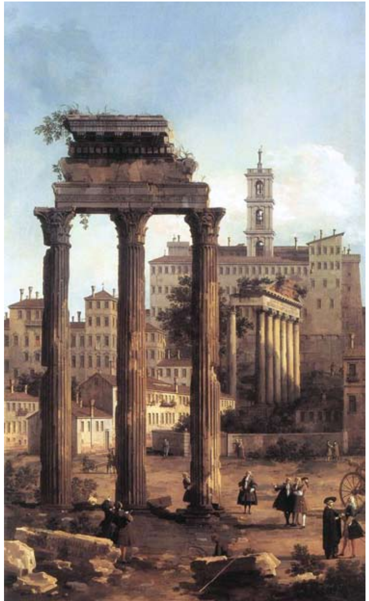
As with the Roman Empire, which collapsed in the 5th Century, today’s hyperinflated British Empire has reached the fag end of its tyrannies. Either it will soon disappear, or the entire planet will sink into a prolonged, global nightmare, a new “Dark Age.” Shown: “Rome: Ruins of the Forum, Looking towards the Capitol,” by Canaletto, 1742.

So, with the decline of Rome, the leading oligarchical families of Rome had fled to the brackish swamps at the north of the Adriatic, to emerge, again, from amid a then-decaying Byzantium, as the reigning imperial