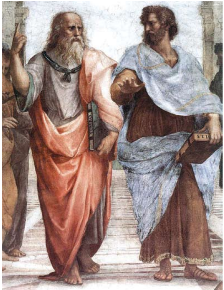
Plato's (left) enemy Aristotle (right), and his delphic follower Sarpi, represent the enemies of justice for mankind, as continued in today's Adam Smith cult. Shown: the central detail of the great fresco by Raphael, "The School of Athens," at the Vatican in Rome (1509-10).

However, the deeper root of the concept of modern imperialism in the Roman tradition, is located in certain pre-Roman developments, including what are classed as what still reign as reflections of outrageously mythical origins. Those conceptions, whether their origins may be, from case to case, partially mythical, or not, are the adopted root of the actual, deeply embedded, traditional conceptions which have defined Europe-centered imperialist forms of all actual monetarist systems dated since the time of the supranational role embodied in the ancient international banking