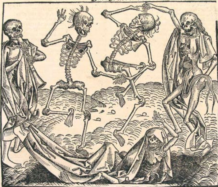
Without a revival of the FDR-era Glass-Steagall principle, humanity faces a general breakdown crisis of the planet akin to that of Europe's 14th-Century "New Dark Age." Shown: A woodcut from the "Dance of Death" series, 41 woodcuts by Hans Holbein the Younger (ca. 1526).

ruinous 1999, Gramm-Leach-Bliley repeal of the U.S. Glass-Steagall law, especially so since Summer 2007 through Autumn 2008), the BRIC (e.g., Brazil, Russia), and the Euro system, have, each and all, presently reached levels within the trans-Atlantic sector, levels which are being now compounded, in effect, as a process of hyper-inflationary acceleration, such that either a Glass-Steagall mode of reform takes over almost immediately, or the British imperial monetarist system will be impelled, out of a desperate attempt at virtually "last minute" self-defense, to detonate the explosive charge which the British monetarist interest has built up, intentionally, since the 1999 cancellation of the U.S. Glass-Steagall law.