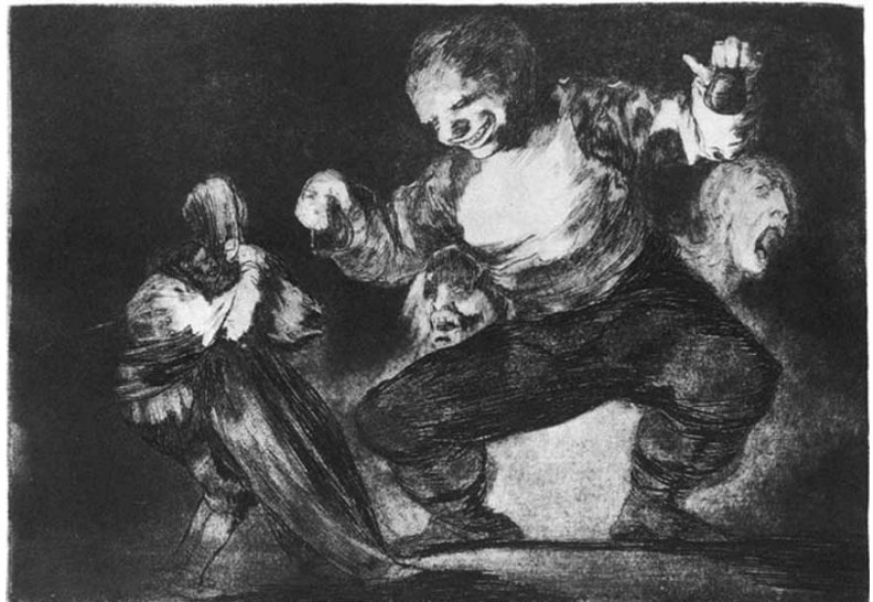
Folly No. 3 "The silliness of current notions of economic policies: What is rotten-wrong with monetarist policies?" —Disparates 4: "The Big Booby," Goya (1815-23)

Earlier in this report, I had emphasized the role of those powers of creativity which are unique to mankind: Man's voluntary creation of the discovery of a universal creation of the universal principles associated with