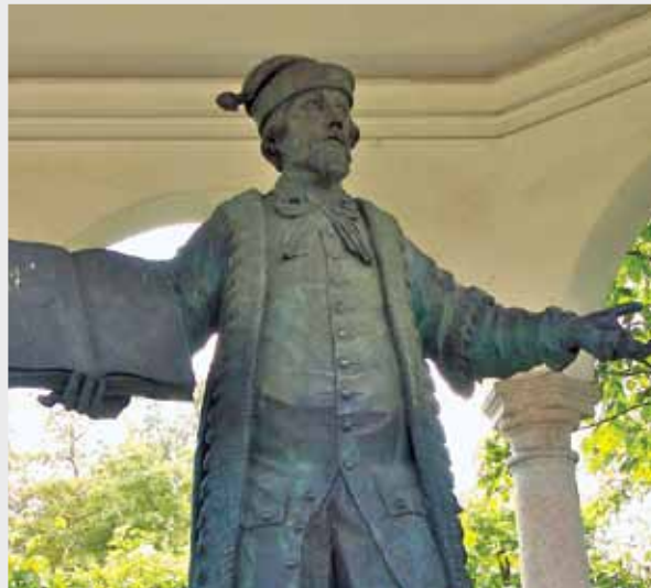
A statue of Johannes Kepler in the gardens at the Linzer Schloss, Austria.

The particular significance of those presented scientific references for our purposes here, is that they provide us access to insight into what might appear to be the “bridges” which are the connections, respectively, to our practical relationship to the real universe, and, also, to interpreting the shadow-land of sense-perception and the latter’s own derivatives. For our immediate purposes here, it is the matter of the “nature” of life, and, qualitatively more important, human life, which is our leading concern at this moment. Only human life’s consciously scientific and kindred practices, present us with access to the knowledge of an actual physical principle, as Bernhard Riemann introduced this conception