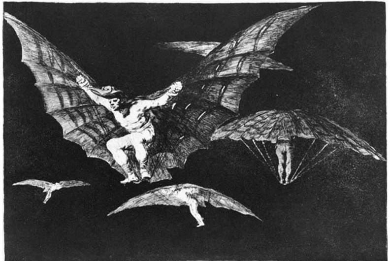
Folly No. 4

Our duty is to set into motion crafted instruments and their effects, by means of which we are enabled to shape developments within our Solar system through the means of an extraterrestrial outreach. That is the outreach through which we can exert control over processes which we, in our own incarnate species-form, could not touch directly with our own, attributable bodily form. It is on the account of that latter, stated role