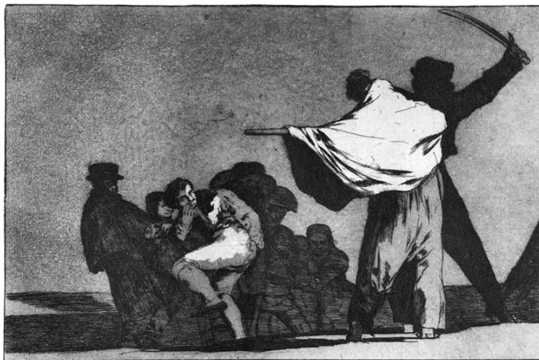
Folly No. 2

Since that latter time, the use of the option of general warfare among leading nations, and, indeed, now,