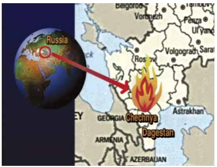
Storm Over Asia

It is our interest to protect and to promote that sov-