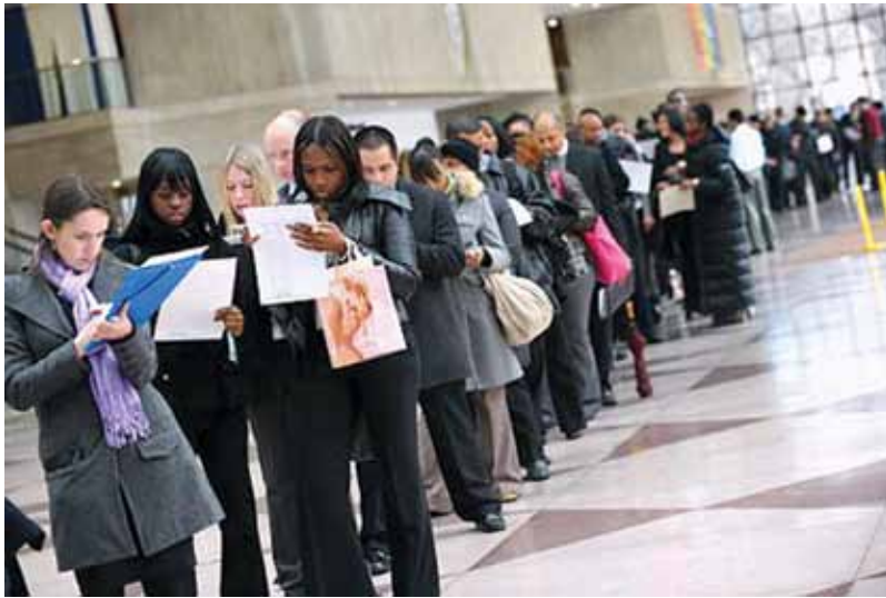
Included in the growing mass of “hidden unemployed” is a disproportionate, and still growing number of young people. Shown: a job fair for City University of New York students and alumni in 2009.

dency, and continues unabated now. When Obama took office in January 2009, the number of Americans of working age not in the workforce was already 81.3 million, or 31% of the maximum potential of the workforce, and that had grown by 1.5 million in the previous year of global financial blowout. But with Obama in office, the number not in the workforce has burgeoned to 87.2 million, more than 36% of the maximum potential workforce. It continues to grow month after month, including by 460,000 in December 2011, the last month for which the Labor Department has published figures.