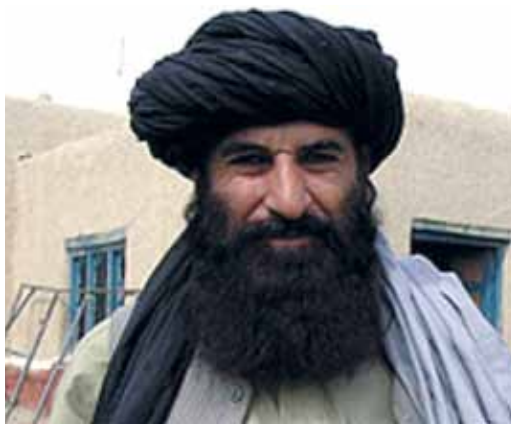
Taliban supremo Mullah Omar, who has escaped capture for years, in an Aug. 18 message, said that Afghan security forces were assisting Taliban fighters who infiltrate their ranks, and that they are “inflicting heavy losses on the enemy,” i.e., U.S./NATO soldiers.

It is unlikely that Panetta’s statement will comfort those families who have lost their sons and daughters, and other Americans who are concerned about these deaths. It is aimed at preventing them from demanding that the United States, having failed miserably in “righting what is wrong” in Afghanistan during its more than a decade’s