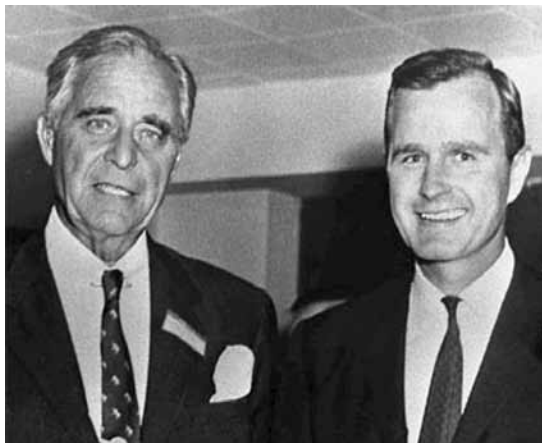
The Bush family have been British assets, LaRouche stated, beginning with Hitler-backer Prescott Bush: "They are the kind of people that Benjamin Franklin wanted to kick out of the country: Put 'em on a boat back to England. But they kept them here; that was a big mistake." Above: Prescott and George H.W.; right: George W. Bush.

Now, the man who actually put Hitler into power in