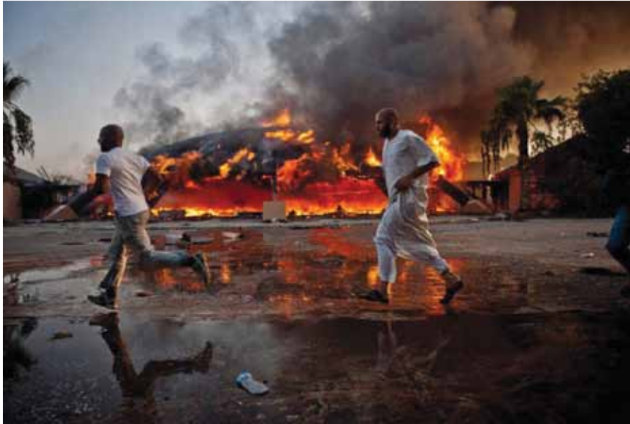
The burning of Colonel Qaddafi's tent in Tripoli, Aug. 24, 2011. Since Qaddafi's murder, the violence has increased.

Up to now, the militias, although not heeding the directives of the TNC, are not trying to overthrow it either. The Council is handling the marketing of oil, which is back up to 1.4 million barrels per day, around the level it was for much of Qaddafi's tenure. (Qaddafi had never gotten above that until the last few years, when it reached 1.7 million bpd. The international oil mafia kept Libya's oil production artificially suppressed during the Qaddafi period.)