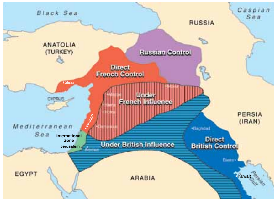
FIGURE 1 The Sykes-Picot Division of the Mideast (1916)

quest of part of the European continent near Vienna. Historically, they wanted revenge. Even nowadays, you can find a trace of this desire for revenge in the minds of many politicians, journalists, scholars. You can find how angry they are against the Muslim-born, or Muslim minority, or Turk minority who are living here.