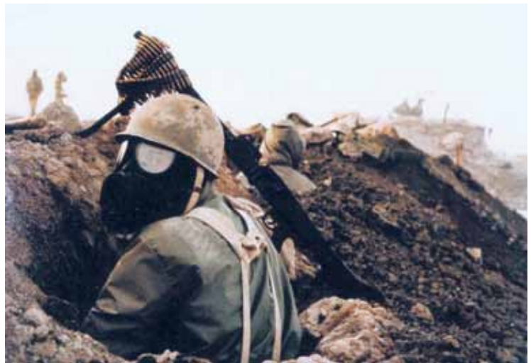
An Iranian soldier during the Iran-Iraq War (1980-88). Saddam Hussein, who was supported by the West at that time, used chemical weapons during the war.