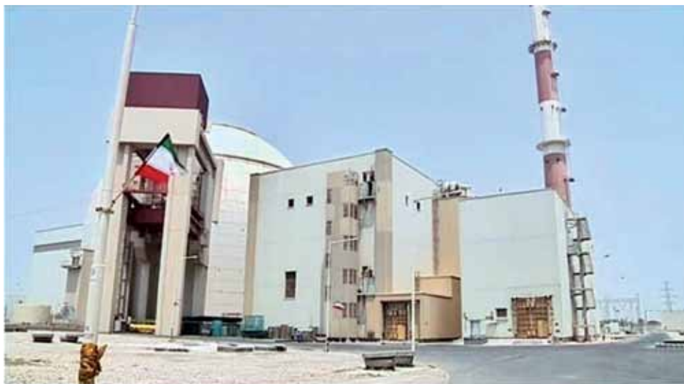
Iran's Bushehr nuclear power plant. The ambassador outlines the numerous reasons that Iran, even though it has oil reserves, thinks it is essential to develop the peaceful use of nuclear power.