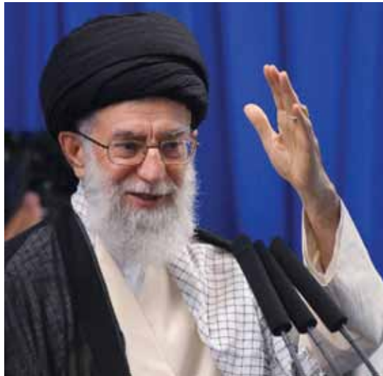
Iran's Supreme Leader, Ayatollah Ali Khamenei, issued a fatwa, or religious decree, forbidding the use by Iran of nuclear or chemical weapons. This is a religious obligation.

At that time, Ayatollah Khomeini, then Iran's Spiritual Leader, said that you cannot use chemical weapons