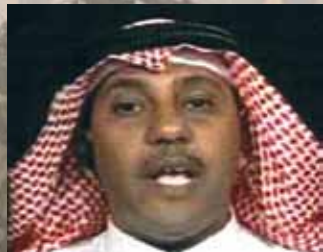
Saudi intelligence agent Omar al-Bayoumi organized the entry of two 9/11 hijackers into the U.S.