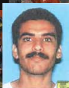
Hijacker Khalid al-Mihdhar; Nawaf al-Hazmi's partner, was also "mentored" by Saudi intelligence.