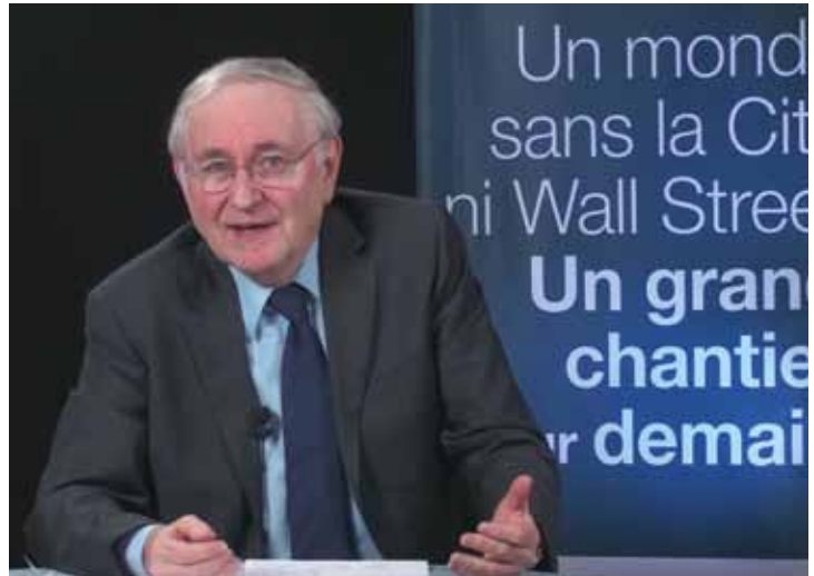
Solidarité et Progrès

So we are in this universe, and we have to get out of it. And it's not a matter of being competitive or not being competitive. It's a matter of working to the benefit of humanity, and to establish a grand design in that direction. And to be really competitive, if you want to have that terminology, is to be the best in working for