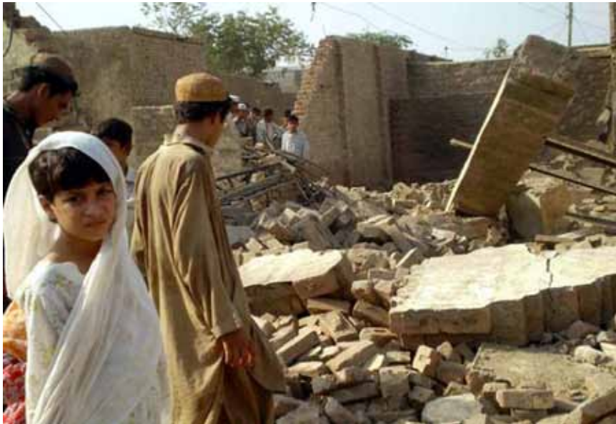
The U.S. carried out 45-52 drone strikes from 2002-08. Obama has conducted almost 300 strikes in the three and a half years since. Shown: the results of a drone strike in Pakistan's FATA region.