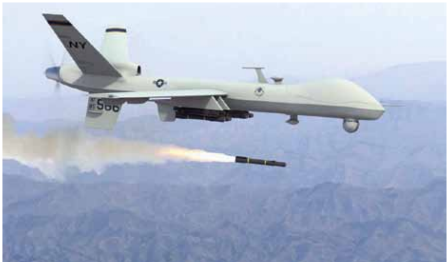
Lawsuits filed by the ACLU and the Center for Constitutional Rights state that the targeted killings of three American citizens in Yemen in 2011 “violated the Constitution’s fundamental guarantee against the deprivation of life without due process of law.” Shown: a Predator drone firing a missile.

In the U.S., the ACLU has two ongoing Freedom of Information Act lawsuits on the drone program, and a third, filed together with the Center for Constitutional Rights, charging that the targeted killings of Anwar al-Awlaki and two other American citizens in Yemen in 2011 “violated the Constitution’s fundamental guaran-