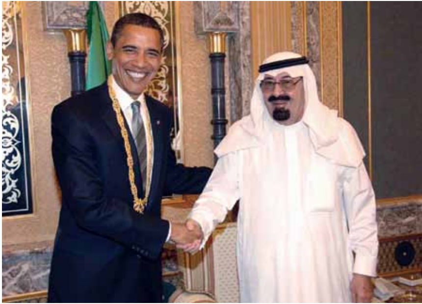
Embassy of Saudi Arabia

Senator Graham has demanded that President Obama declassify a 28-page chapter dealing the role of the Kingdom of Saudia Arabia, and support for Osama bin Laden and al-Qaeda. Here, Obama gets warm and fuzzy with Saudi King Abdullah, June 2009.