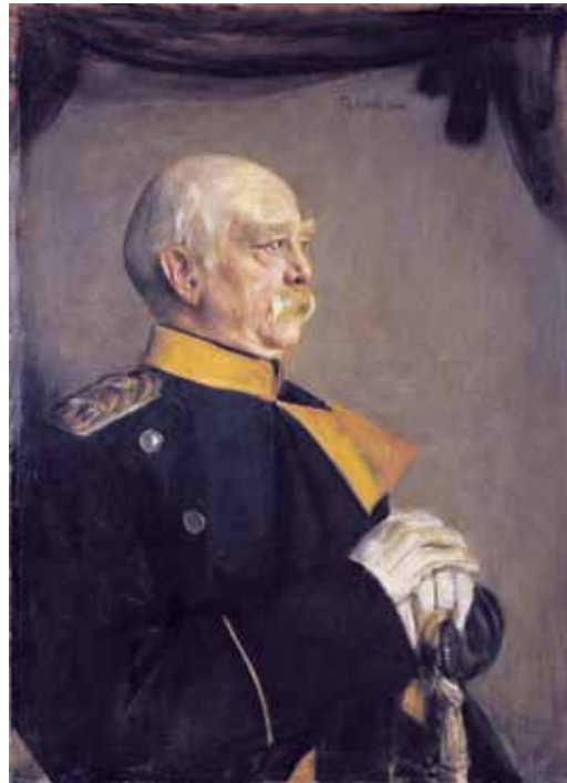
The effects of the ouster, by the British Empire, of Chancellor Otto von Bismarck in 1890, created a "continuing vacuum in the moral decline of civilized life generally," notably, as it led directly into the First World War, and what followed.

The principle put at issue on that specified account, has been that exhibited in the case of Cusa's De Docta Ignorantia , the work on which all among the greatest valid discoveries of all of the valid progress in modern European science have since depended. The outcome of that specific set of discoveries, is also typified by