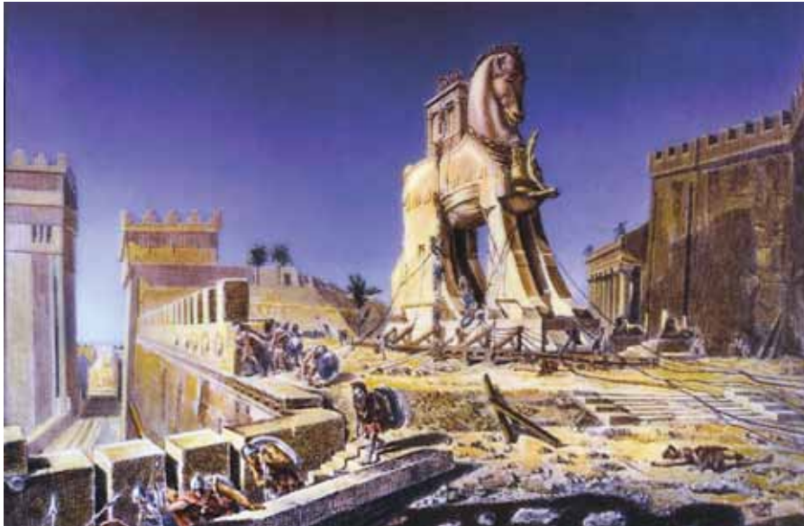
The U.S. voting population's acceptance of Obama as President can be compared to the decision, by the duped citizens of the city of Troy, to open its gates to the great Wooden Horse, which conveyed the means of their destruction.

too brief a lead-time for steering us into safety by presently known, available means. That, therefore, would put us all in a situation in which mankind's systemic error might be that of wishing to presume the adequacy of the rates of scientific progress of a society which must resign itself to accepting an apparently inevitable lack of the means to turn that threat aside in a timely fashion, while still merely wishing for the best. 2