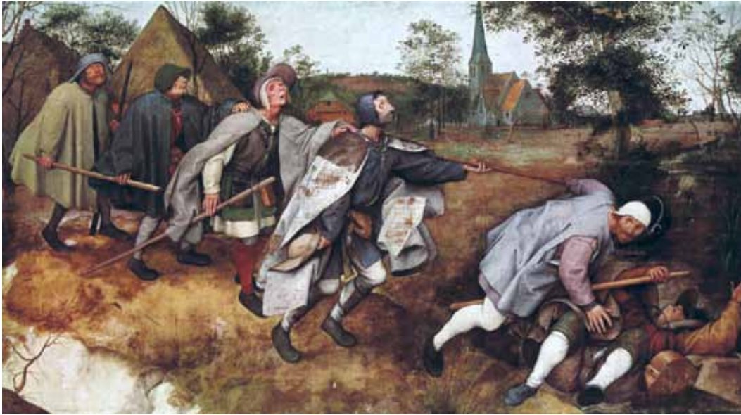
“The folly of ‘blind faith’ in the axiomatic presumptions respecting the systemic meaning of mere sense perception”: “The Blind Leading the Blind,” Peter Bruegel the Elder (1568).

nized through the means of evidence to such effect, that the existence of the effects of human life on Earth—and, therefore, implicitly everywhere, is now a conception prompted by need to study a possible remedy for the colossal, present threats of human extinction by the influence of the so-called “green movement.” Such threats are to be recognized, for example, in the lack of needed, relevant development of relevant man-made systems, systems which must continue to be built up on Mars—whether or not mankind actually takes up some human residence there within the span of the coming generation or two. That means that we must assist in bringing about the deep-rooted change which lead away from those cults of sense-certainty which continue to cramp the mental powers of even a wide majority among relevant types of scientists now.