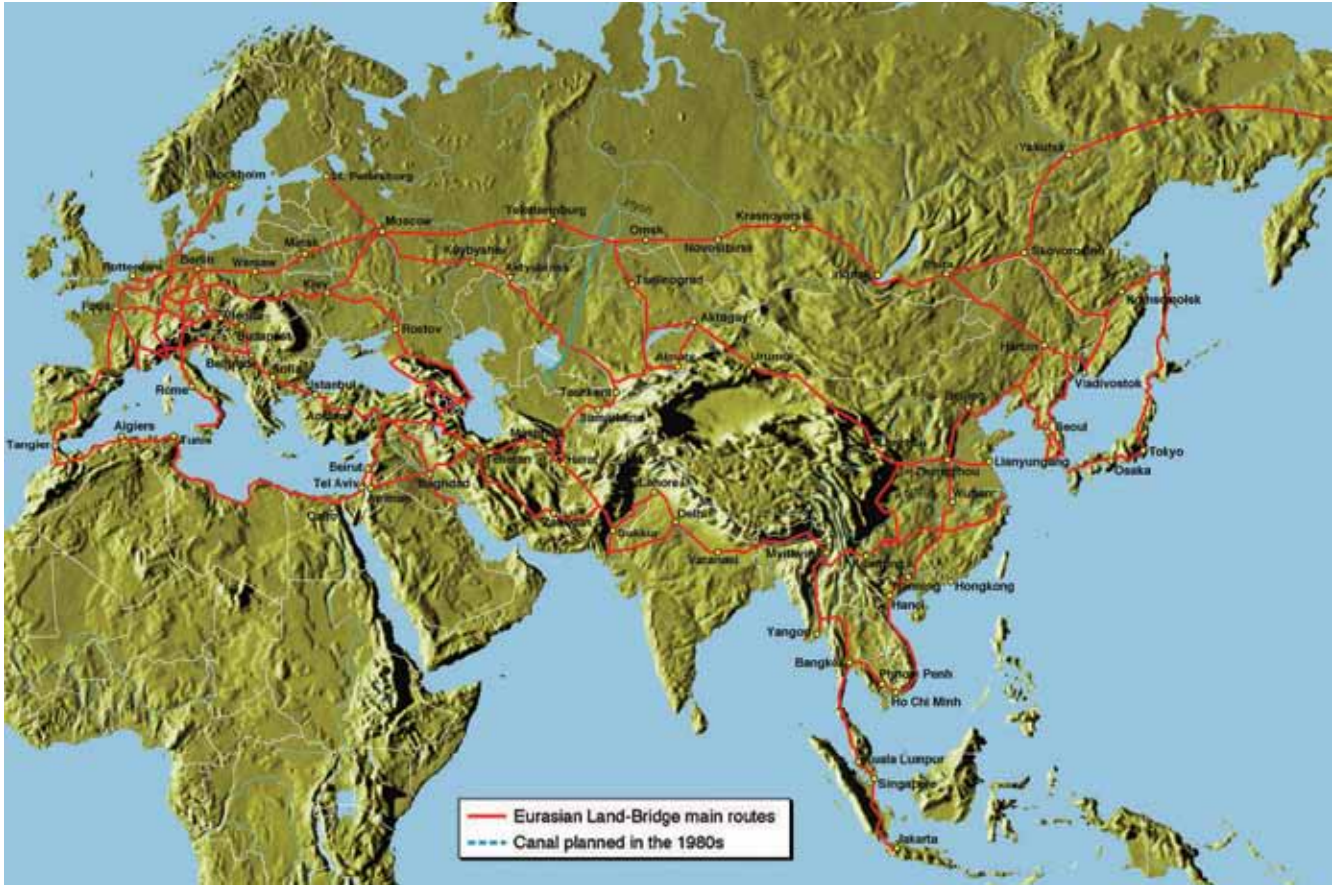
FIGURE 1 The Eurasian Land-Bridge