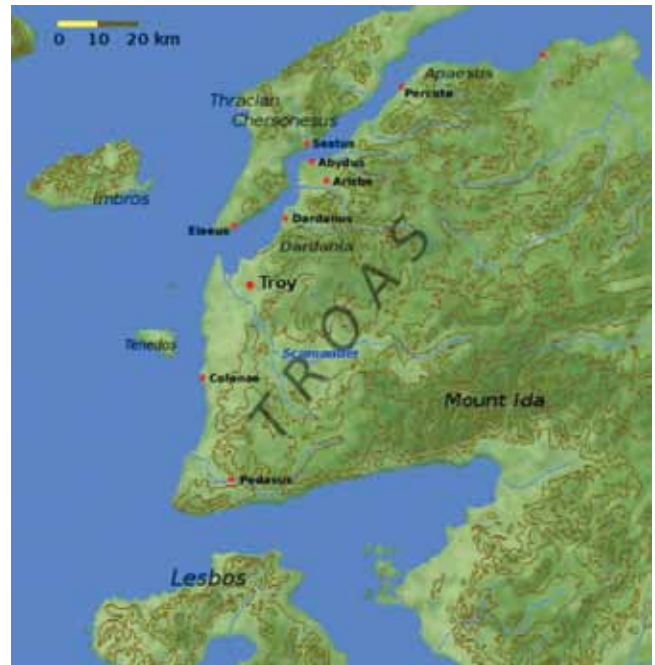
Troy's citadel overlooked the Dardanelles, giving the city control over East-West trade and commerce.

aus . . . we are not going to leave a single one of them alive, down to the babies in their mothers' wombs—not even they must live. The whole people must be wiped out of existence, and none be left to think of them and shed a tear.” 9