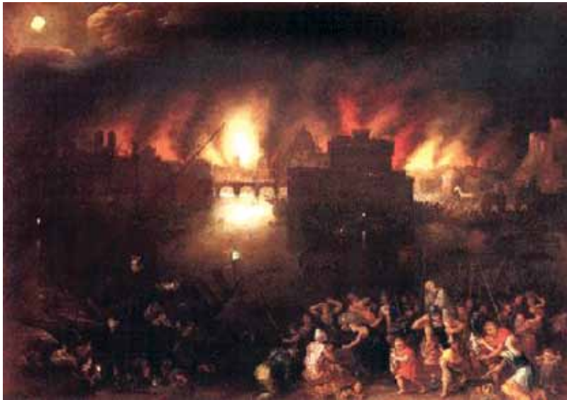
In the Iliad , Agamemnon tells his brother Menelaus, “We are not going to leave a single one of them [the Trojans] alive...” Shown: “The Burning of Troy,” by Jan Bruegel the Elder (1621).

Zeus, as an ancient precursor to today’s “Green Movement,” desires to relieve the overburdened Earth of carrying too many people. In the third fragment of the Cypria we learn that: