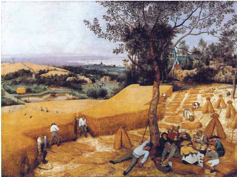
It was the intention of Cusa “to free the brutally subjected victims of Mediterranean-centered imperialist systems,” by inspiring what became the voyages of Columbus to the “New World.” In his painting, “The Harvesters” (1565), Peter Bruegel the Elder contrasts the bestial-like state of the peasantry, with the wide world that opens up across the great ocean.

employs as our species’ process of climbing upward, as by discrete intervals, towards goals of ever-higher orders (e.g., “leaps”) of man’s selection and employment of “energy-flux density” as a method: as mankind’s own, practically universal meaning of “fire.” The ordering of successively higher ranges of “energy-flux density,” in discrete, rather than merely gradual leaps forward in chemistry, is a convenient definition of the function associated with mankind’s practiced use of “fire,” so estimated.