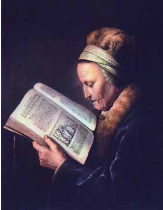
It is time for mankind to achieve a “‘fourth state’ of maturation of the human species,” LaRouche writes: “the realization of a newly added, higher category (a fourth) of the human mind: (foetus, child, post-adolescent, and “transcendental”): e.g., ‘forethought,’ ‘noetic.’” Shown: “Old Woman Reading,” Gerrit Dou (a student of Rembrandt, c. 1630).

I explain. Sense-perceptions are to be properly defined as being merely a kind of shadows, and should be recognized as such, if and when they are treated according to a higher order of reality. That had been done by those from among the greatest figures of modern science, such as Nicholas of Cusa and his discoveries, as in his De Docta Ignorantia (1440), in which he had already demonstrated that to be the case. I mean the actual reality of the proof of the discovery made by man’s creative demonstration of all that are properly known as being universal physical principles, as this was demonstrated implicitly in such exceptions as the work of both Max Planck and Albert Einstein, in particular. The basis for that class of true knowledge, corresponds implicitly to the precedents of the opening statements by Bernhard Riemann, as in the opening statement of the plan of his hypotheses respecting the founding of what had been actually a physical geometry, in his habilitation dissertation.