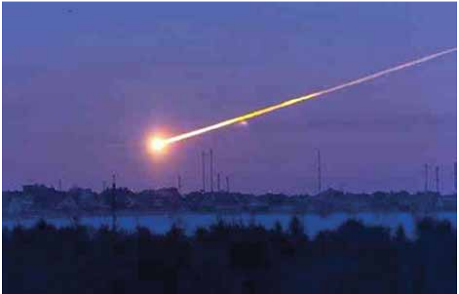
The defense of Earth against the threat of asteroids and related conditions must be considered as a primary responsibility of mankind today. Shown: a meteor speeding toward Earth, which then exploded over Chelyabinsk, Russia on Feb. 15, 2013.

With the placing of assigned synthetic creatures, such as “Curiosity” working in place, a new freedom of mankind, one ironically echoing Bernhard Riemann’s opening statement of the opening plan of the famous hypotheses of his habilitation dissertation, springs forth in the necessarily provoked imagination, bringing our