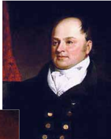
Alexander Hamilton (below): the founder of the original economic policy of the United States; the bold and masterly James Monroe (left); and John Quincy Adams, the organizer of the system of economy of the Federal states.