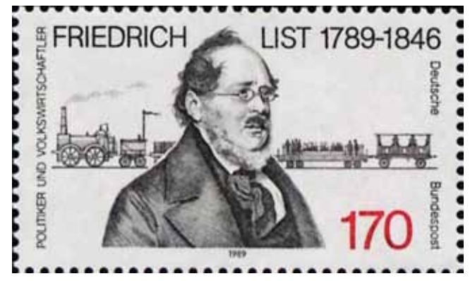
The "Father of the German Railroads"

The power to create wealth is therefore infinitely more important than wealth itself; it guarantees not only the possession and increase of what has been acquired, but also the replacement of what has been lost. This is even more the case with whole nations, that cannot live on pensions, than with private persons. Germany has been ravaged in every century by plague, by famine, or by internal and external wars, but it has always managed to save much of its productive forces, and so it returned quickly to prosperity, while the rich and powerful, but despot- and priest-ridden Spain, in full possession of domestic peace, sank ever deeper into poverty and misery. The same Sun shines upon the Spaniards, they have the same earth and land, their mines are just as rich, they are the same people as before the discovery of America and before the introduction of the Inquisition; but this people has gradually lost its productive power, so it has become poor and miserable. The North American liberation war