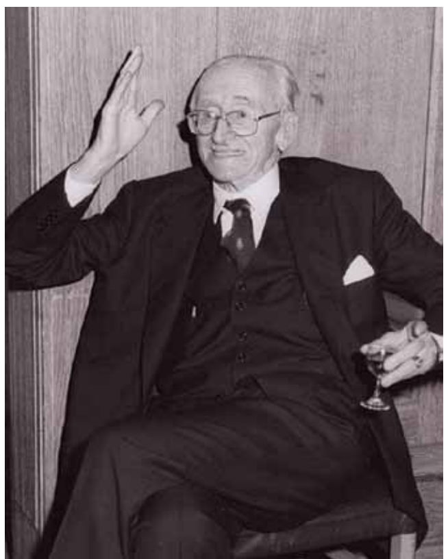
London School of Economics

The founding of the Vienna School in 1871 pursued no other objective than to cause List's work to sink as quickly as possible into oblivion, so as to present anew the British free-trade doctrine as the only valid approach. List's ideas—including all that are based on them—are systematically slandered by the Vienna School as socialist, dictatorial, or proto-fascist, up to the present day. Von Hayek pilloried List as the princi-