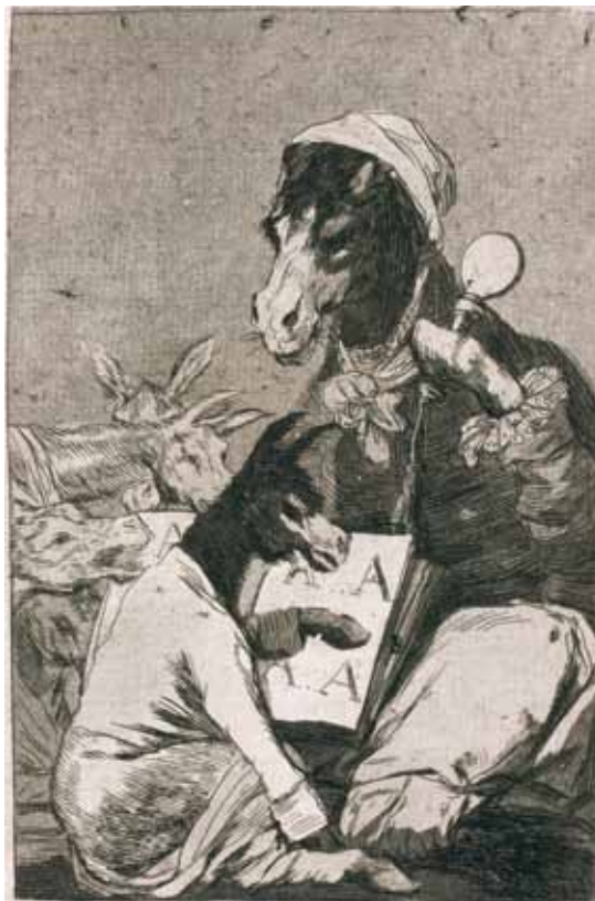
The folly of most modern education, writes LaRouche, is "a commonly misguided standard for the practice of an 'education' rooted in what are actually pathetic presumptions respecting the nature of the human mind." Shown: Goya, Capricho 37, "Might not the pupil know more?" (1797-98).

The evil which that aforesaid moment of history rep-