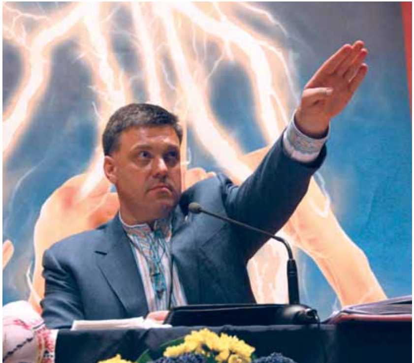
Oleh Tyahnybok, the head of Svoboda, denounces a “Moscow-Jewish mafia” that he says rules Ukraine, among other unpublishable epithets.

It is this Bandera-Lebed legacy, and the networks spawned in the postwar period, which are at the center of the current events in Ukraine.