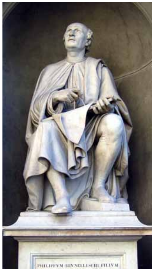
"All modern science of any competence, depended upon two great figures of the Renaissance period, Cusa and Brunelleschi, the older figure, who invented physics! He built a great cathedral; it was the first miracle of this type ever created." This statue shows Filippo Brunelleschi (1377-1446) looking upward at his beautiful creation, the dome on the Cathedral of Florence.

But the human body has two crucial points. One is the human brain; the other is the human mind. The human mind is the product of the noëtic process operating on the brain. So therefore, when you die, if you're a scientist, you're dead. You're silenced, your body no longer functions, it goes away, disappears. But then, when you look at the case of Max Planck, or Albert Ein-