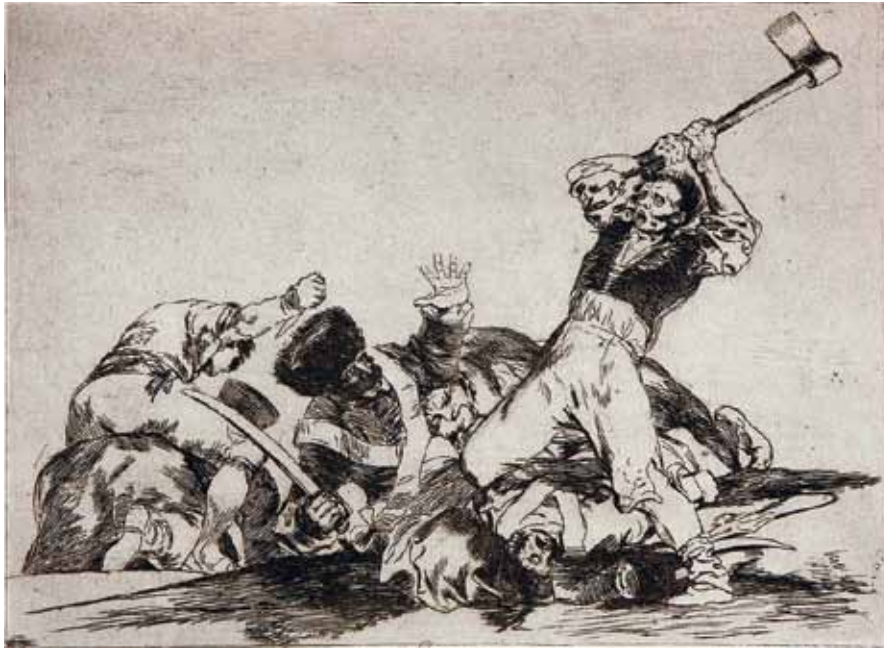
From Goya's "Disasters of War" (1810-20), Plate 3 "Lo Mismo" ("The Same"). The series of etchings depicts the horrors of the Napoleonic occupation of Spain. Goya visited many battle sites around Madrid to witness the Spanish resistance, in what he described as "el desmembramiento d'España."

His pleasure in our existence; it were best, to pursue that implied warning. We have been given, this far, this much. Time is running out.