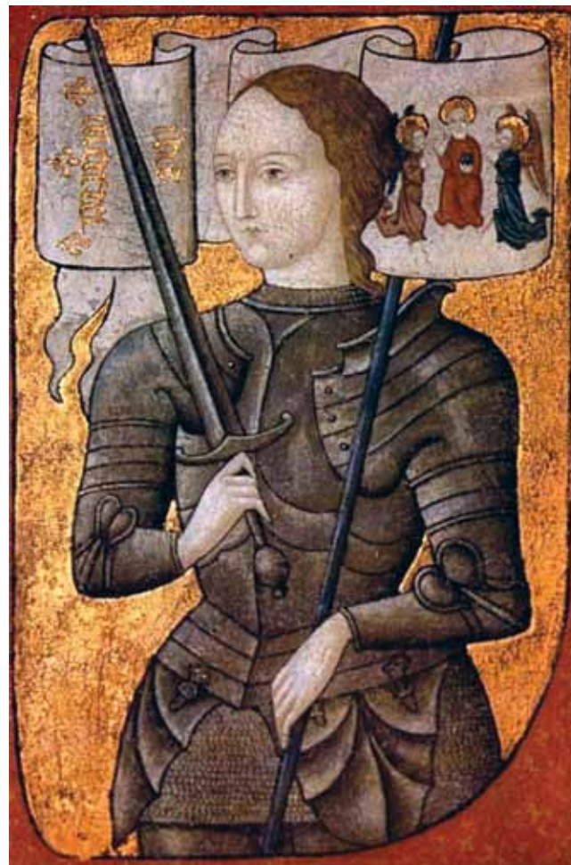
The Satanic crime of the murder of Jeanne d’Arc (1431) sent shockwaves through Europe. “From this origin in history, there came the great Renaissance,” LaRouche writes. This French miniature depicts Jeanne in her military garb (ca. 1485).

They, that clergy included, had denied Jeanne women’s clothes, and then mocked her, and blamed her for what they, alone, had done. They condemned her to death. They baked her to death, in an inferno; then, they had stopped the fire, to see if she were dead. When they had been satisfied that she was, in fact, dead, they had restarted the fire, to destroy the evidence that she had lived. The modern men and women of Wall Street differ little from such monstrosities as those.