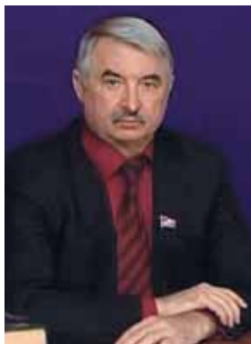
Volodymyr Marchenko is the chairman of the All-Ukraine Trade Union Organization.

Another problem is that European values include the rule of law. Natalia Vitrenko showed that the agreement witnessed by the three foreign ministers included a demand to change the Constitution, to alter the state system of Ukraine, in the space of 48 hours. They changed the Constitutional system illegally, shifting