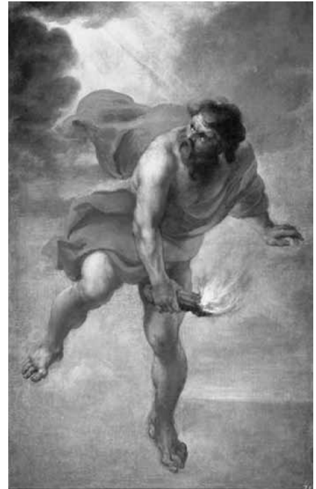
From ‘Prometheus Bound,’ Aeschylus (ca. 430 B.C.)

Prometheus: Yes, and from it they shall learn many arts.