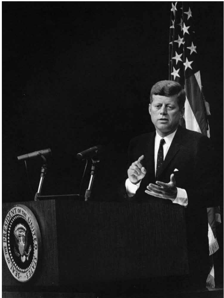
John F. Kennedy Presidential Library and Museum, Boston