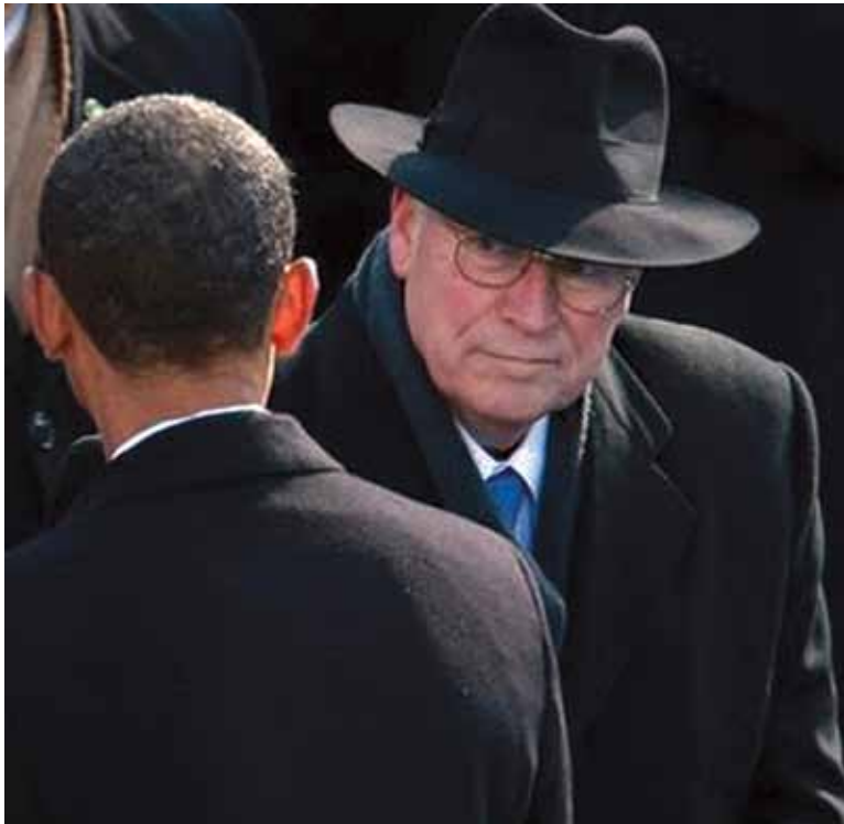
Avoidance of a British imperial launching of a global thermonuclear war depends upon the ouster of both Barack Obama and Dick Cheney from continuing influence in our republic's affairs.

Such is the presently great historical irony of the immediate, global existential crisis of the world at large presently. Let the members among the ranks of our U.S. Government cease to be such craven fools as they have been lately.