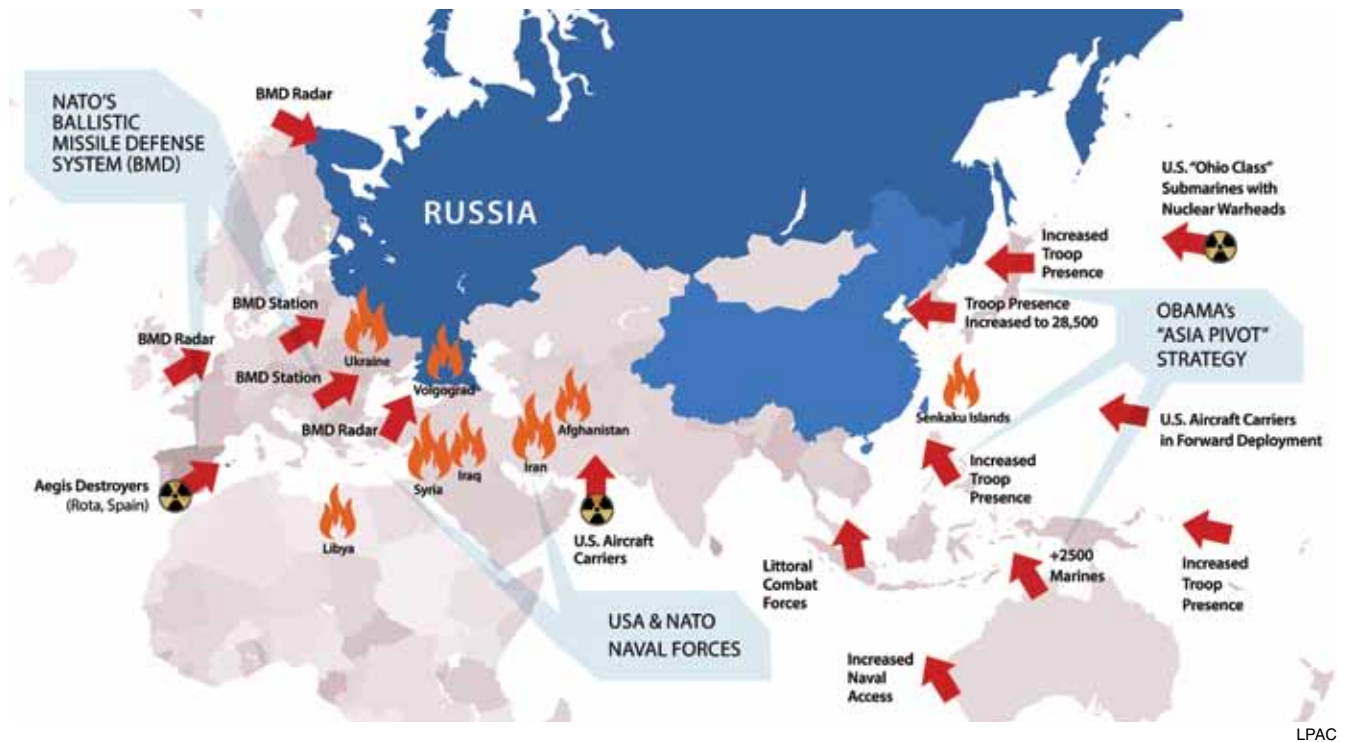
FIGURE 1 The Military Encirclement of Russia and China

The reason I'm saying this, is, as we have published in the past, you cannot look at the effort to enlarge NATO eastward, up to the borders of Russia, including the expansion of the EU up to the borders of Russia, as an isolated fact. Just a couple of days ago, Mr. [Jack] Matlock, the former ambassador of the United States [to the USSR], in this crucial period, reconfirmed, that there was a promise by [George H.W.] Bush in 1990-91, that there would be no enlargement of NATO. This promise was given also to [former Russian President Boris] Yeltsin; it was given to [former German Chancellor Helmut] Kohl, to [former German Vice Chancellor Hans-Detrich] Genscher, and obviously, this promise was completely broken, and NATO was expanding into all kinds of East European countries, step-by-step encircling Russia.