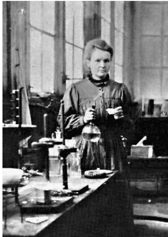
Marie Curie (1867-1934), the scientist who discovered radium. Chemistry, said LaRouche, “is man’s sacred power to develop mankind itself, to a higher, more powerful species, in our present domain, and in facing the challenge whereby the Solar System and beyond is going to come to us, and say, ‘Do this.’”

We need to start at the beginning, on the question of the green policy. The green policy is the key to understanding the difference between Satan and Christianity,