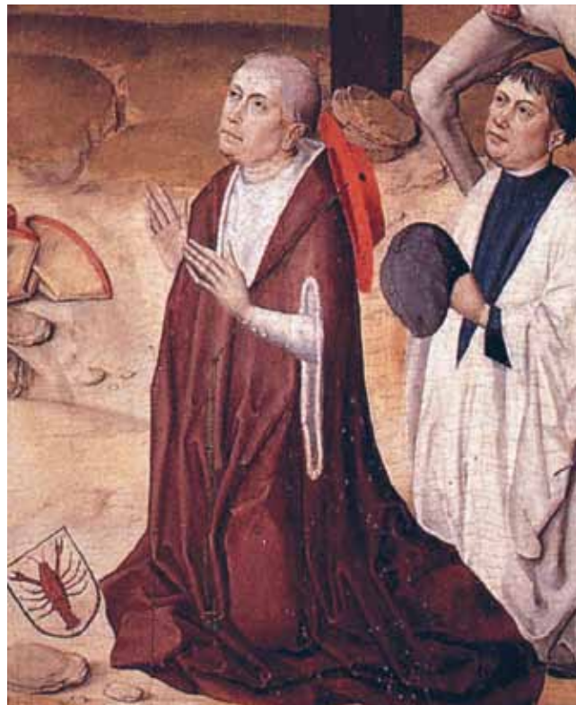
Cardinal Nicholas of Cusa (1401-64): “Mind is not of the nature of changeable things which it grasps by sense perception, but of unchangeable things which it discovers in itself.”

Well, from the standpoint of mathematics, it’s an utter paradox. From the standpoint of reality, it simply