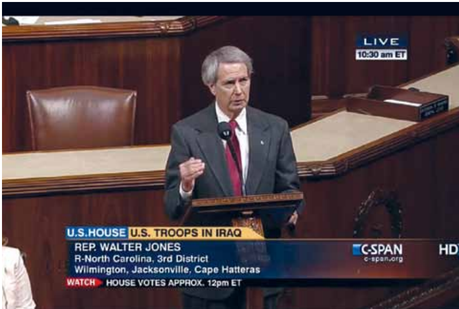
Rep. Walter Jones (R-N.C.), a sponsor of the resolution demanding that Congress abide by the Constitution, addresses the House of Representatives on July 25, before the resolution passed overwhelmingly.

out response? Why is Obama hiding? Why is he just taking the blows, and not even attempting to defend his honor in terms of what he's doing? Obama has been exposed as a faker."