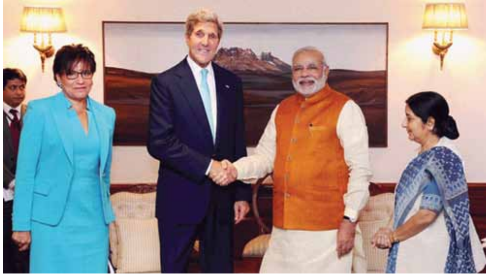
Prime Minister of India