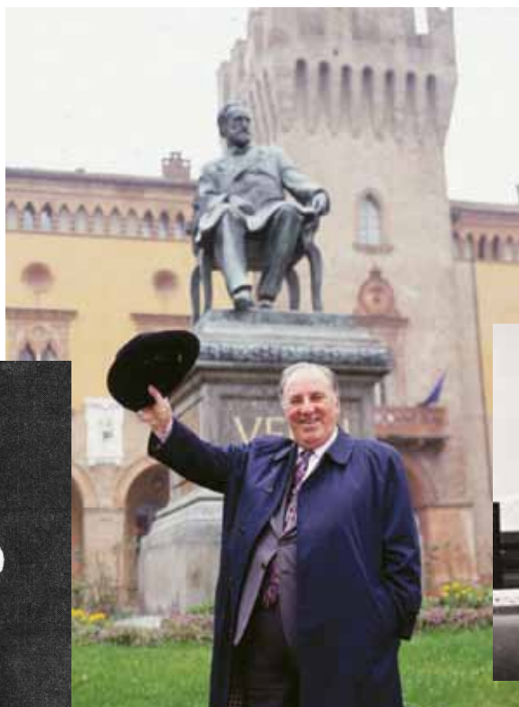
Carlo Bergonzi, standing in front of the Teatro Verdi, and a statue of the great composer, Piazza Giuseppe Verdi, Busseto, Italy (left). The Maestro conducting a demonstration of singing A=432 vs. A=442, Carnegie Hall, sponsored by the Schiller Institute and the Italian Cultural Institute, April 8, 1993 (below).

Born in Vidalenzo di Polesine Parmense, near Parma, Bergonzi is considered the most important Verdi tenor of the past century, also because he is the only one who recorded all 31 Verdi arias for tenor. As he told me in the first interview he granted me in Busseto, for the German magazine Ibykus , he started singing at the Parma Conservatory as a baritone, but in 1950, during the performance of “Madame Butterfly”