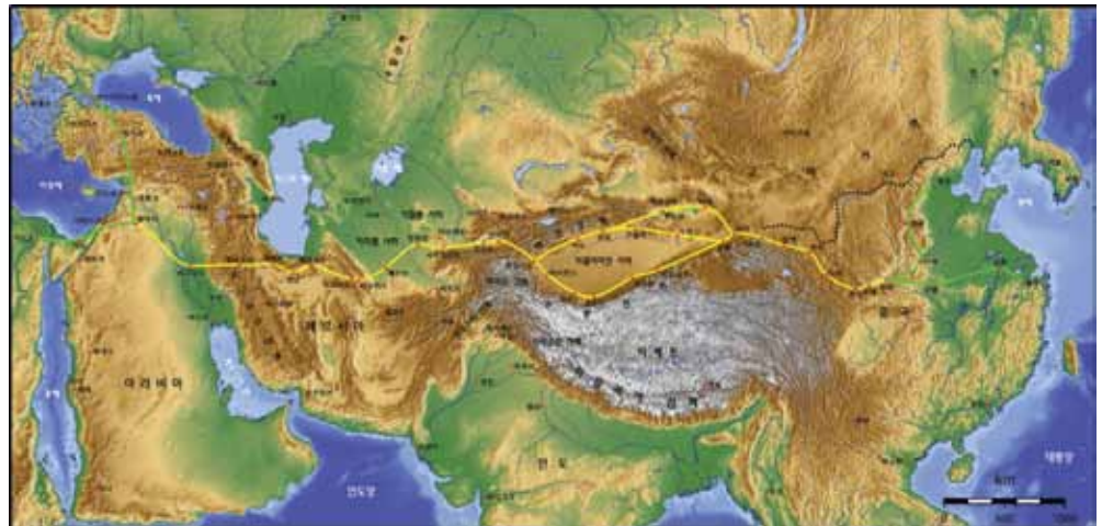
FIGURE 1 The Ancient Silk Road

be international cooperation between Russia, China, India, Iran, the United States, and Europe; they all have to work together to solve such a problem. So I think that when Xi Jinping talked about that a security order must be inclusive , that you cannot have peace for some countries and chaos in other countries, that is absolutely correct: There must be an inclusive security architecture.