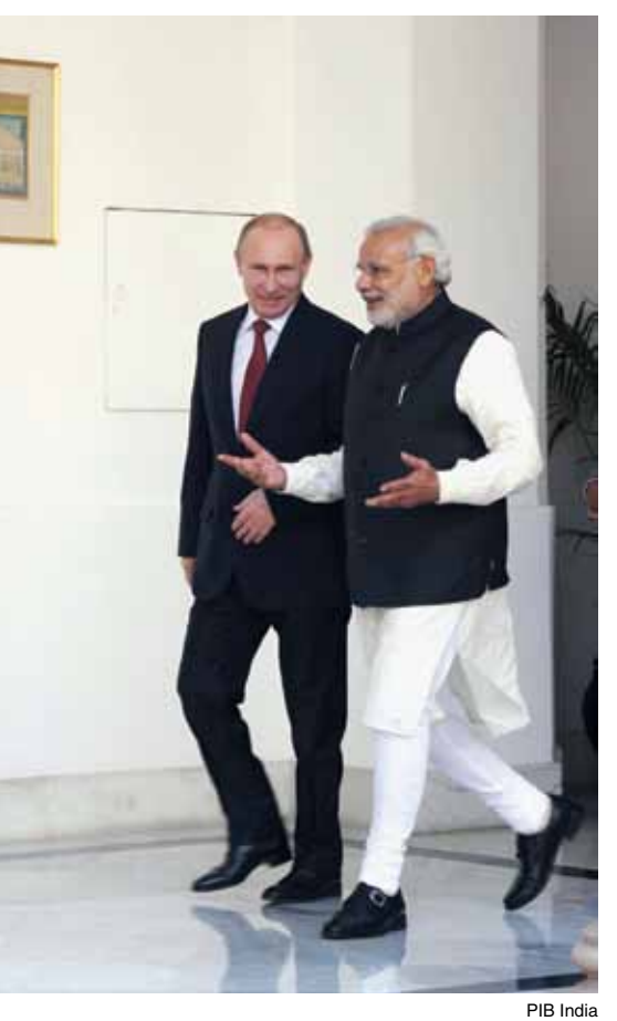
The Dec. 11 summit in New Delhi between President Putin and Prime Minister Modi reflected the continuing consolidation of the polycentric world order that began with the BRICS initiatives last Summer.