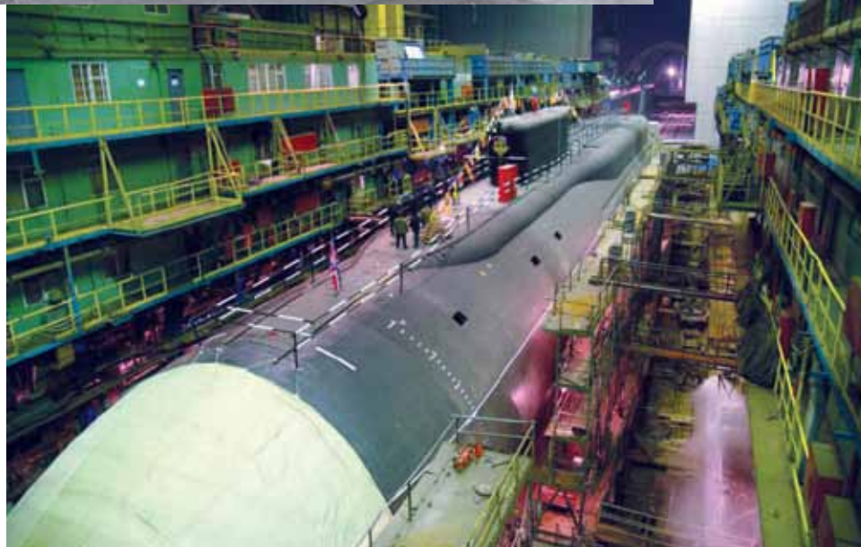
Russian leaders are making clear that they view the financial warfare against their country as a threat that could lead to general war, and they are upping their military capabilities accordingly. Left: President Putin visits the anti-submarine ship Vice Admiral Kulakov; below: the Alexander Nevsky, a Borey-class submarine, is assembled at the Sevmash shipyard.

now (as opposed to coup-plotting), in response to the West’s growing pressure against Russia; that is the subject of the next section of this article. Second, the coup that really did take place in 2014—in Ukraine. That was the one where the U.S. State Department, and British and EU officials, backed the ouster of an elected President, by a violent, partially NATO-trained paramilitary force espousing a neo-Nazi ideology, as documented in two EIR dossiers of the past year. 1