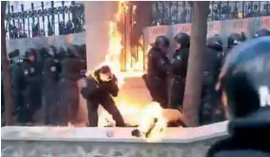
Regime change in Ukraine: The Maidan protests turned violent when the Nazi groups took over. Here, on Jan. 22, 2014, a policeman is set on fire by a Molotov cocktail thrown from the crowd.