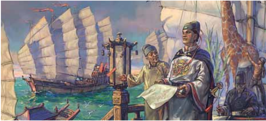
Admiral Zheng He's first voyage in 1405 included more than 300 ships, the largest fleet the world had seen until World War II; Zheng's armada traveled as far as the east coast of Africa.

the Zheng He missions were scrapped after the seventh voyage in 1435, and China largely cut itself off from the rest of the world.