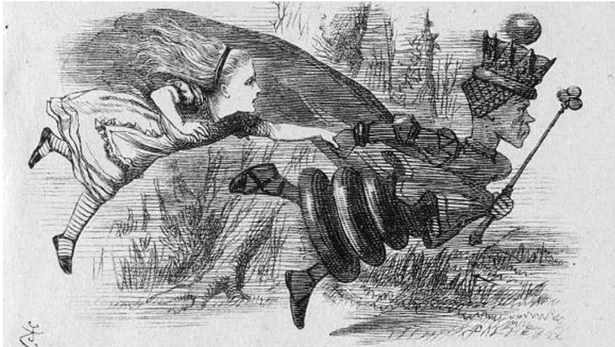
From John Tenniel's 1865 illustrations for Lewis Carroll's "Through the Looking Glass."

contributed to the climate in which Hoover, Cohn, and Spellman could literally get away with mass cultural murder.