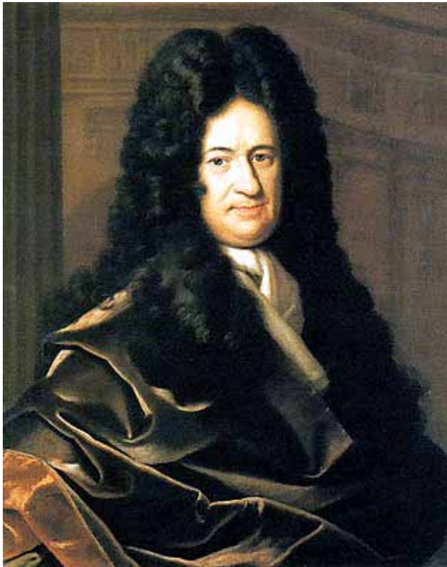
Gottfried Leibniz (1646–1716) developed the infinitesimal calculus, a language that allowed change itself to be substance.

Take another example: LaRouche has been emphatic about the destructive effects on science in the 20th Century, especially the role played by Bertrand Russell, in his promotion of an attempt by David Hilbert, in the very early 1900s, to do something that might seem so abstract or academic as to be unimportant, that its importance can be overlooked. Hilbert had proposed, as a study, to determine whether it was possible to turn mathematics (arithmetic, in particular) into logic. Was it possible to derive all of the properties of arithmetic—adding and multiplying and subtracting and dividing, and a few other things—was it possible to derive everything interesting about that, from logic itself, from the deductive process?