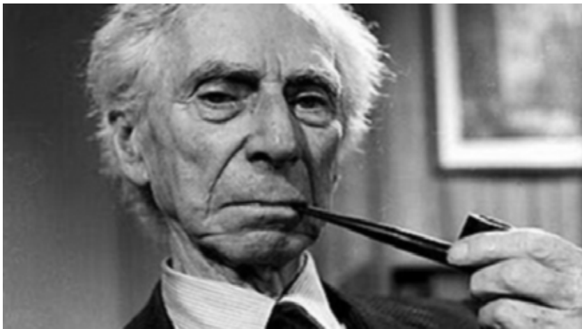
The evil Bertrand Russell, who tried to eliminate both creativity and people

Kepler created. He discovered; he created.