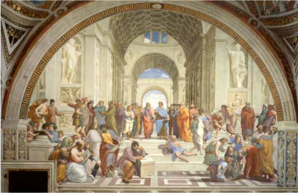
LaRouche references Raphael's School of Athens as representing a simultaneity of eternity, in which thinkers of different eras meet, outside of time.

place in Africa, [Oklo in Gabon – ed.]) but overall it's a process that really just doesn't occur. Or consider the kind of fusion that we're working on creating in our laboratories. Although it's based on what we believe to be taking place in stars and other things, the way that we would be creating it, is something that's never happened before. Or coal burning and then producing motion: That doesn't happen without people.