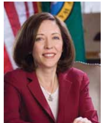
Maria Cantwell (D-Wash.)

Re-instating Glass-Steagall is “not an impossible dream,” said LaRouche. Here, the four Senators who initiated the Twenty-First Century Glass-Steagall Act (S. 1709) in the current session of Congress.