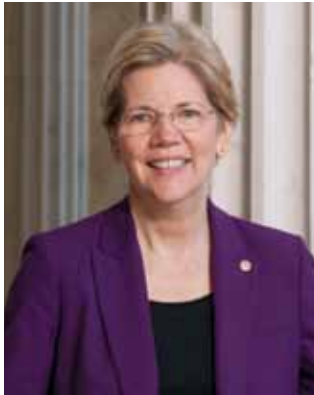
Elizabeth Warren (D-Mass)