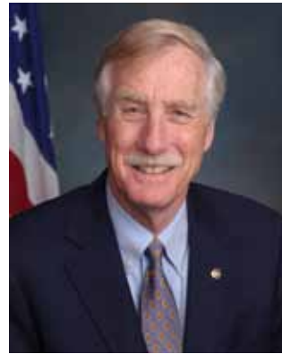
Angus King (I-Maine)