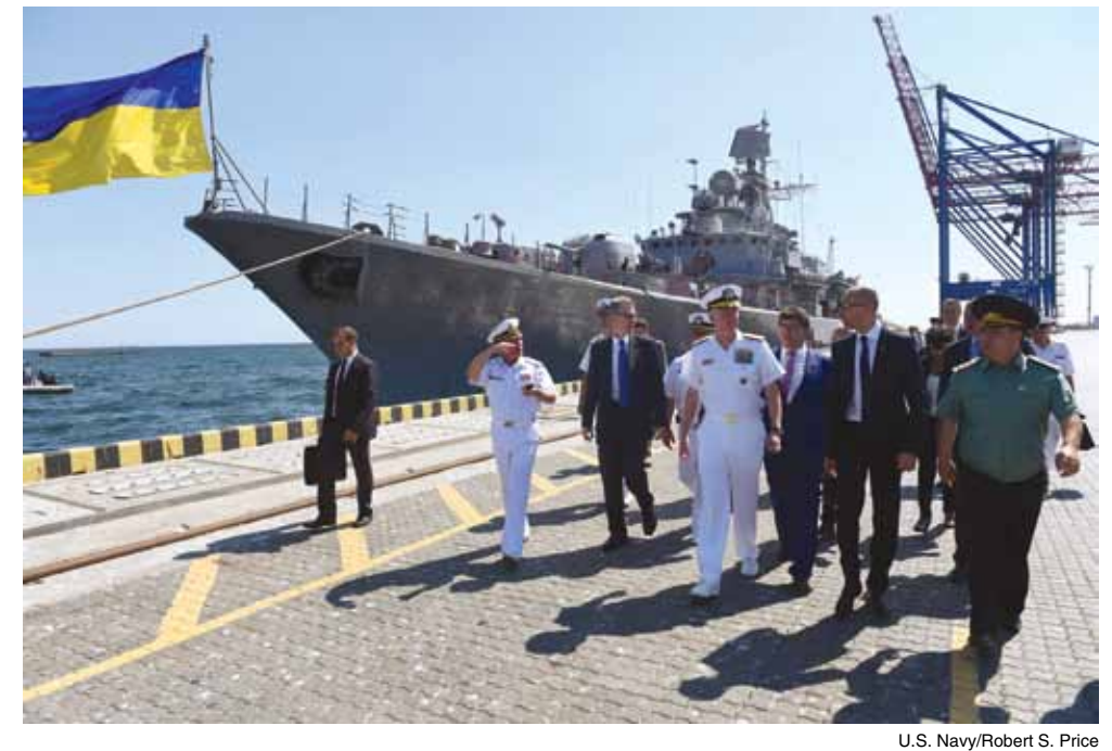
U.S. and Ukrainian officials at the kickoff of NATO's Sea Breeze-2015 maneuver in the Black Sea, September 1, 2015.

Well, Mr. LaRouche said obviously there is the possibility of solving this terrible crisis, this war that has been waged