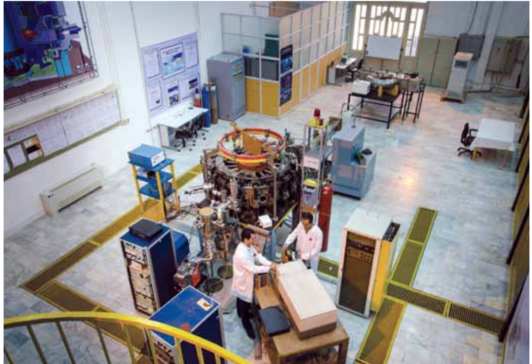
Plasma Physics Research Center/Islamic Azad University

Ghoranneviss: The ITER project is facing many challenges. In order to solve the problems of fusion, small tokamaks in different countries are used, because