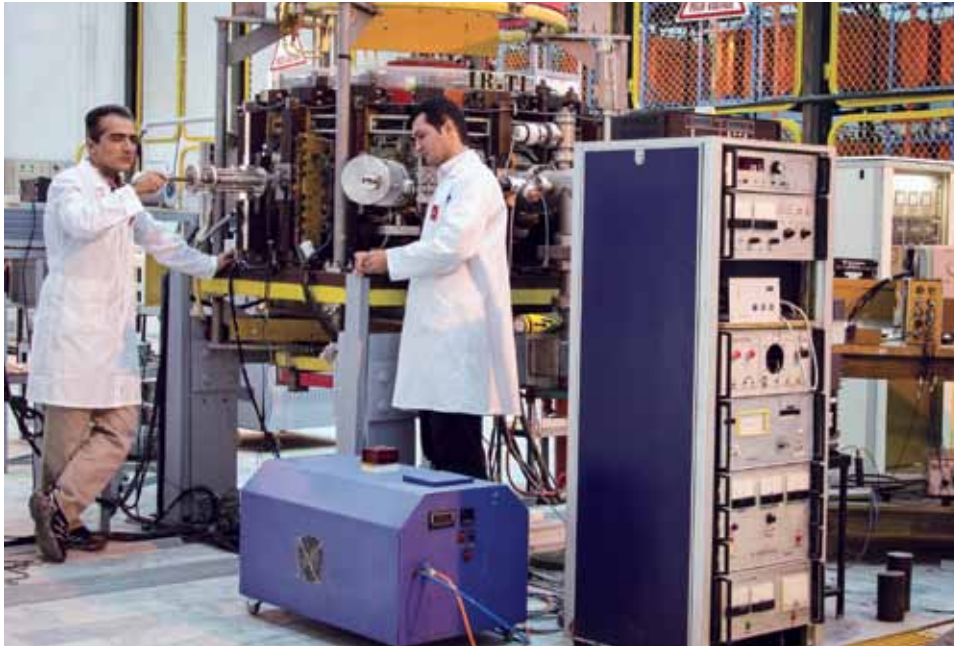
Plasma Physics Research Center/Islamic Azad University

Diagnostic instruments inserted inside the tokamak provide scientific measurements of plasma parameters and behavior.